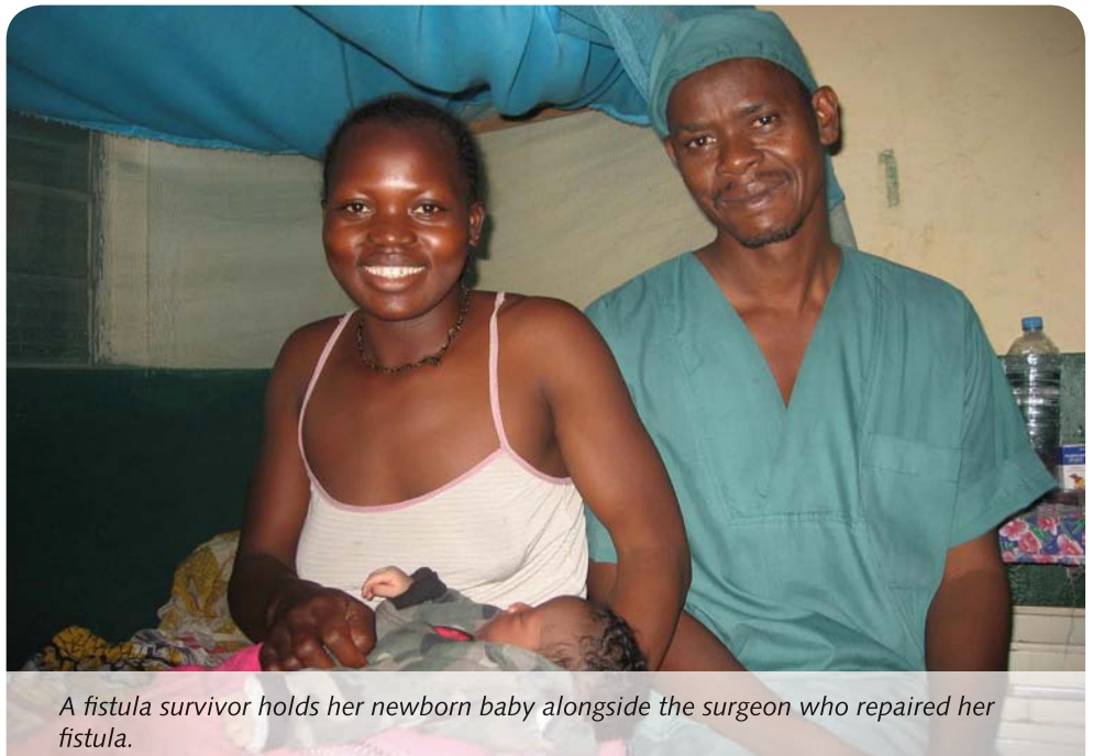
A fistula survivor holds her newborn baby alongside the surgeon who repaired her fistula.

The Market Town Approach has been a critical and highly successful component of the fistula care program in Kissidougou. It has increased local ownership of fistula