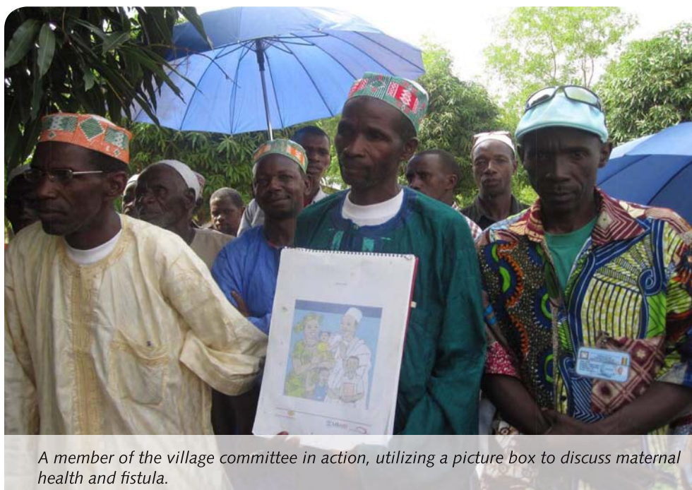
A member of the village committee in action, utilizing a picture box to discuss maternal health and fistula.

Reintegration: The waiting home and host families facilitate reintegration of patients into society. They provide transitional experiences that support women before they return home.