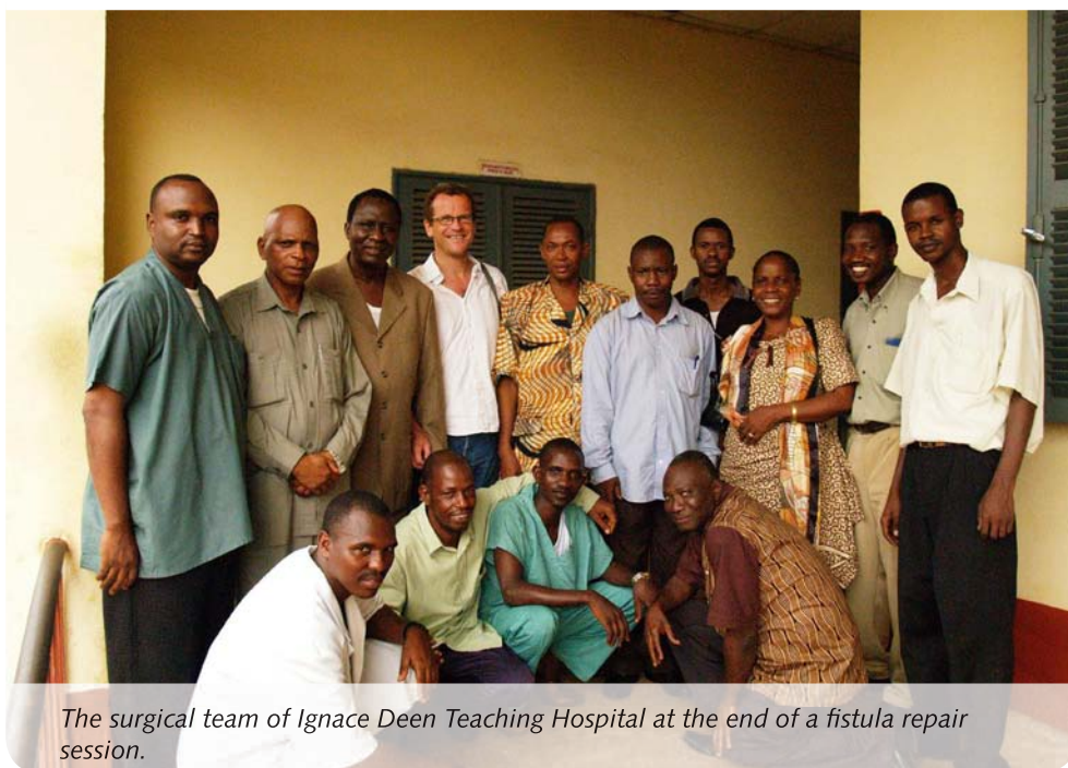
The surgical team of Ignace Deen Teaching Hospital at the end of a fistula repair session.

Because the Kissidougou experience has been positive, Fistula Care has replicated the approach in the Labe Region. Members of Kissidougou's UDC have served as peer mentors for that