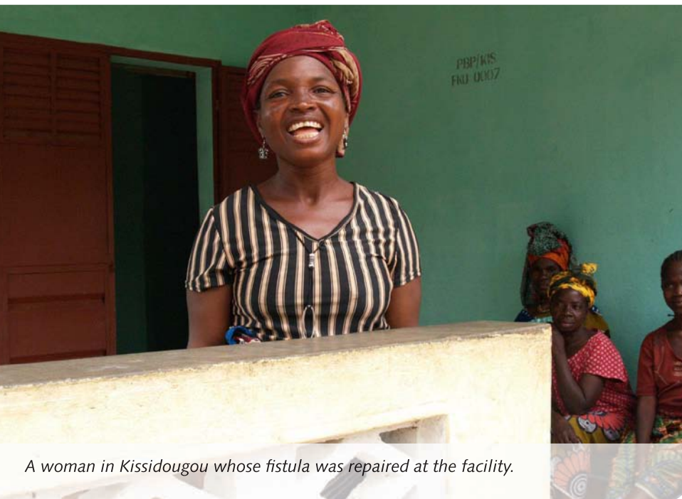
A woman in Kissidougou whose fistula was repaired at the facility.

To engage with the community, committee members visit family compounds, checking in with pregnant women, and participate in social events such as weddings and baptisms to deliver health talks. During these activities, volunteers discuss fistula and its causes. They encourage women to receive antenatal care and to deliver at a health facility. In addition, committee members have the following responsibilities: