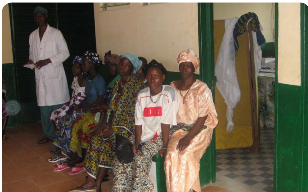
Women attending an outreach session at the Kissidougou maternity ward.

In addition, the program needs to do more work to address the psychosocial