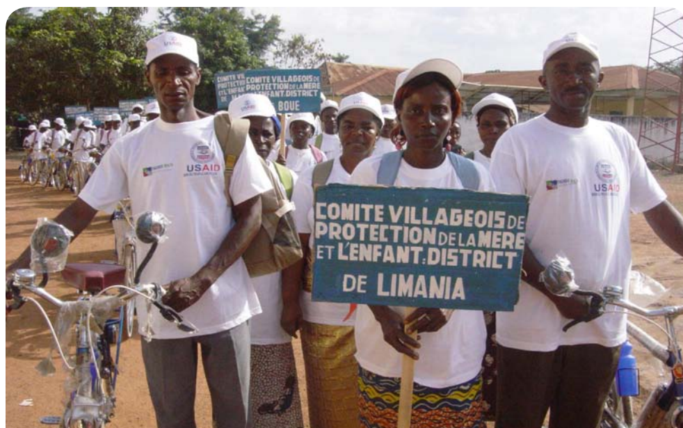
The launch of community activities to raise awareness of fistula in the village of Limanya, Kissidougou.

Committee members have faced many challenges, including transportation issues and the limited number of opportunities to make visits during rainy season and harvest time. Despite such difficulties, committee members are strongly dedicated