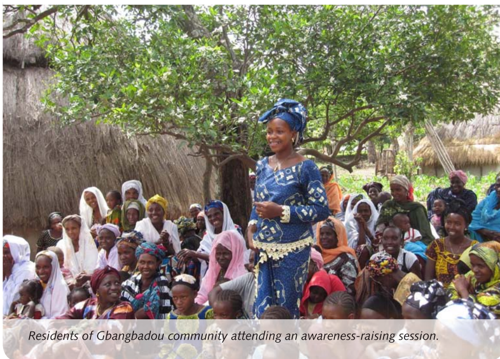
Residents of Gbangbadou community attending an awareness-raising session.

Since the intervention began, the market has operated more efficiently, and the training and regular meetings increased trust and transparency, the vendors’ confidence in the district-level government, and their willingness to pay their taxes, as they are well-informed about and participate in determining how funds will be used. As a result, the district’s revenue from the market has